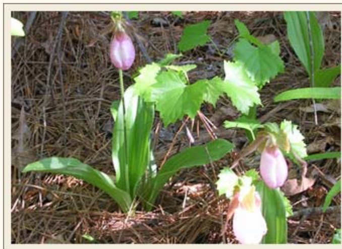
Wildflowers in bloom

Serenbe's natural beauty, environmental consciousness and unique character have attracted an imaginative, diverse group of homebuyers -- full-time artists, doctors, authors, government leaders, a fireman and technology professionals, just to name a few. For some this is their first mortgage and for others it is their fifth second home. Residents are coming from Los Angeles, San Diego, New York and all around Atlanta. Our dream of creating a vibrant community that is built upon the various talents and shared values of its residents is becoming a reality.